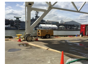
New York City Pier 88 & 90 Underwater Cellular Piling Repair

Production fees range from $35.00 to $60.00 per cubic yard of material produced