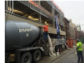
Manhattan New York Light Weight Floor Decking