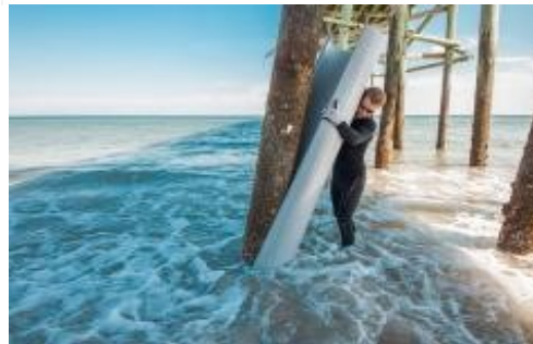
Pile Jacket piling repair form being installed on damaged piling