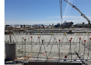
Las Vegas Light Weight Road Base