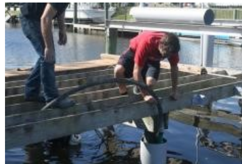
Filling Piling Jacket with underwater cellular concrete for life time repair

CGPS uses ASTM approved Admixtures and reliable, high quality equipment