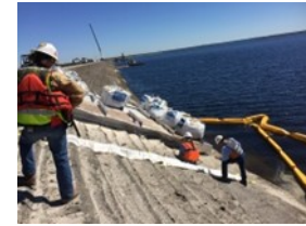
Florida Dam Repair Underwater Cellular Grout

Mix Design program by Cellular Concrete Technologies Enables us to accurately design any cellular grout or cellular concrete to engineers specifications