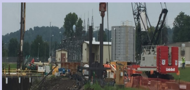
Hydro electric dam Ohio River

Coordinate with the local concrete pumper and installation crew for a seamless installation